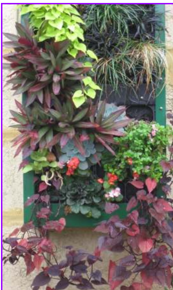
Small custom gardens can turn a boring sterile courtyard into a very pleasant area

In line with research, Vertical Gardens WA uses plants