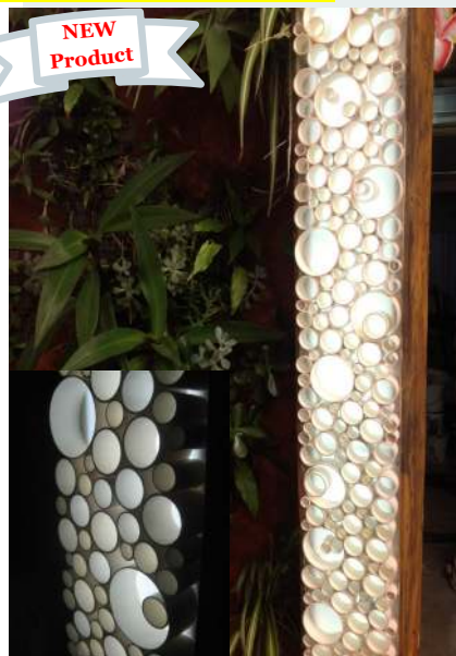
Living garden lights structures, a hot selling product developed specially to bring together art, light and life to a garden.

Ray's and Susanne's work can be seen on the Vertical Gardens WA website http://verticalgardenswa.com.au