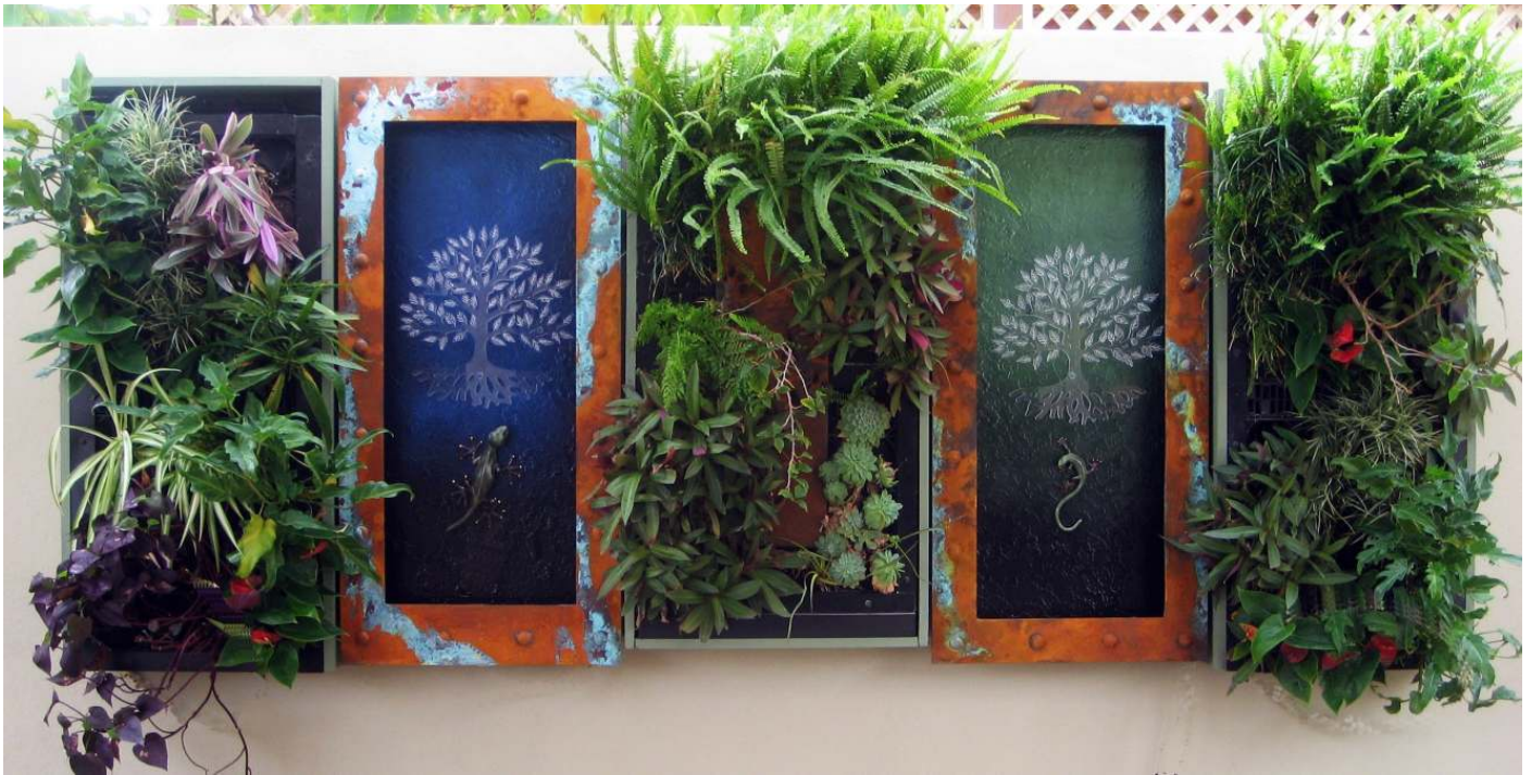
Specially designed for a client with a special request: to respond to a limited budget with a design that imparts a strong visual impact. It features three garden panels separated by panels featuring inserted LED lights. The result is a stunning effect that works in daylight and at night.