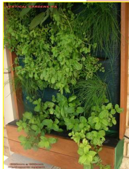
Hydroponic unit for a TV program featuring vertical gardens

Our approach to service is one of consulting with our clients to develop solutions tailored to clients' needs, space or light limitations and corporate scheme or interior décor. Our expertise and experience can guarantee that our products provide the benefits and advantages of a vertical garden for years to come.