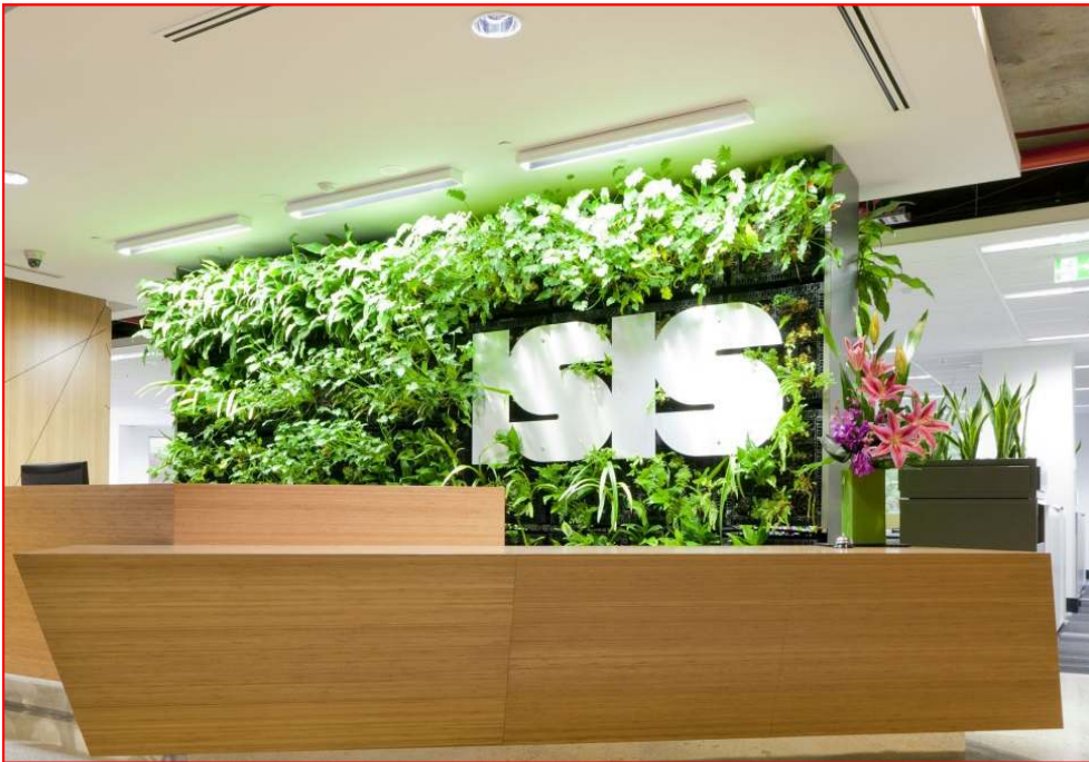
Commissioned by Perth's first 5 star green rated company when they moved into their new premises, this is the largest Green Wall build in the city. Double sided, it is primarily planted with Spathyphylum petites to counteract possible toxic emissions due to new building products